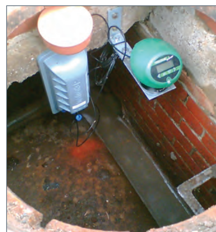
IMP MONITORING IN A CSO CHAMBER