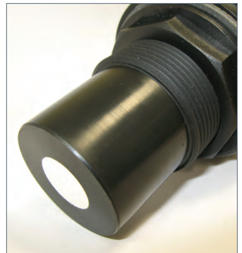
STANDARD IMP FACE