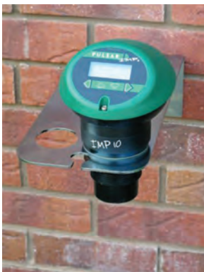
SPECIALLY DESIGNED IMP BRACKET IS ALSO AVAILABLE