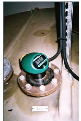
IMP ON A MIXING TANK