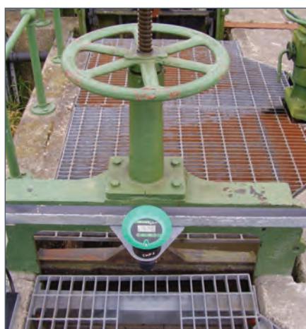
IMP CONTROLLING SCREEN HEIGHT