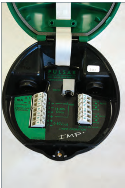
INSIDE OF STANDARD 2/3 WIRE IMP