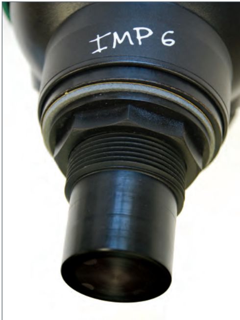
PVDF NOSE CONE OPTION

The full IMP range is available with the wetted parts in PVDF build alternative for corrosive or aggressive applications. The picture below shows a PVDF nose cone on an IMP 6 unit.