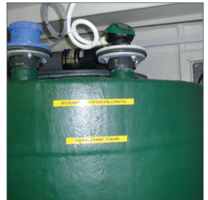
IMP ON CHEMICAL TANK