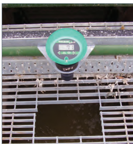
IMP CONTROLLING GATE HEIGHT