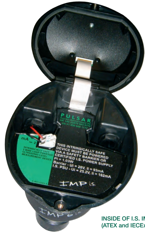
INSIDE OF I.S. IMP (ATEX and IECEx)

The full IMP range is available with the wetted parts in PVDF build alternative for corrosive or aggressive applications. The picture below shows a PVDF nose cone on an IMP 6 unit.