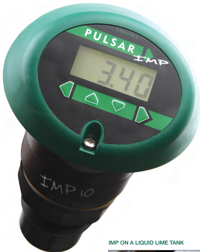
IMP ON A LIQUID LIME TANK