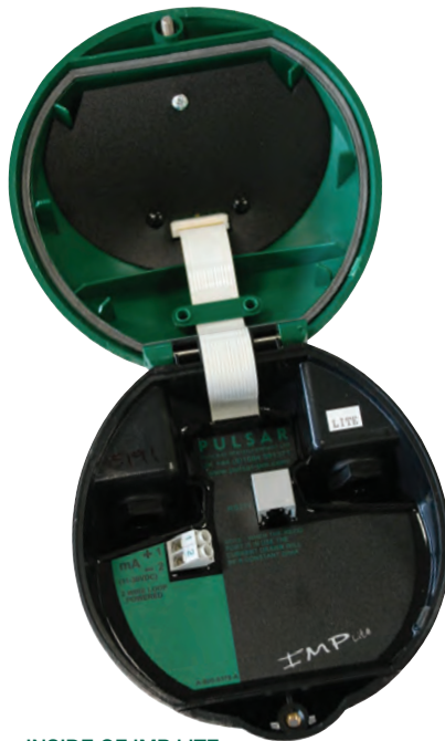
INSIDE OF IMP LITE SHOWING RJ11 PORT